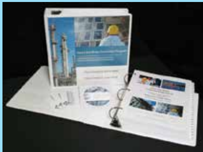
Pro Series A1 OSHA Safety Manual Logo and Custom Pictures w/Index Tabs