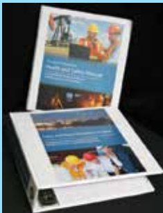
Pro Series A2 Standard Color Cover

888.801.0247 / www.OSHAComplianceGroup.com